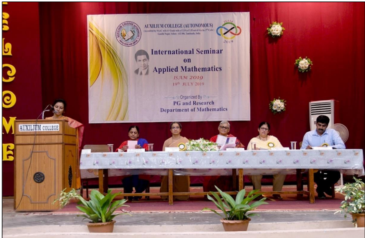
International Seminar on "Applied Mathematics (ISAM 2019)" Organized by the PG & Research Department of Mathematics on 19.07.2019