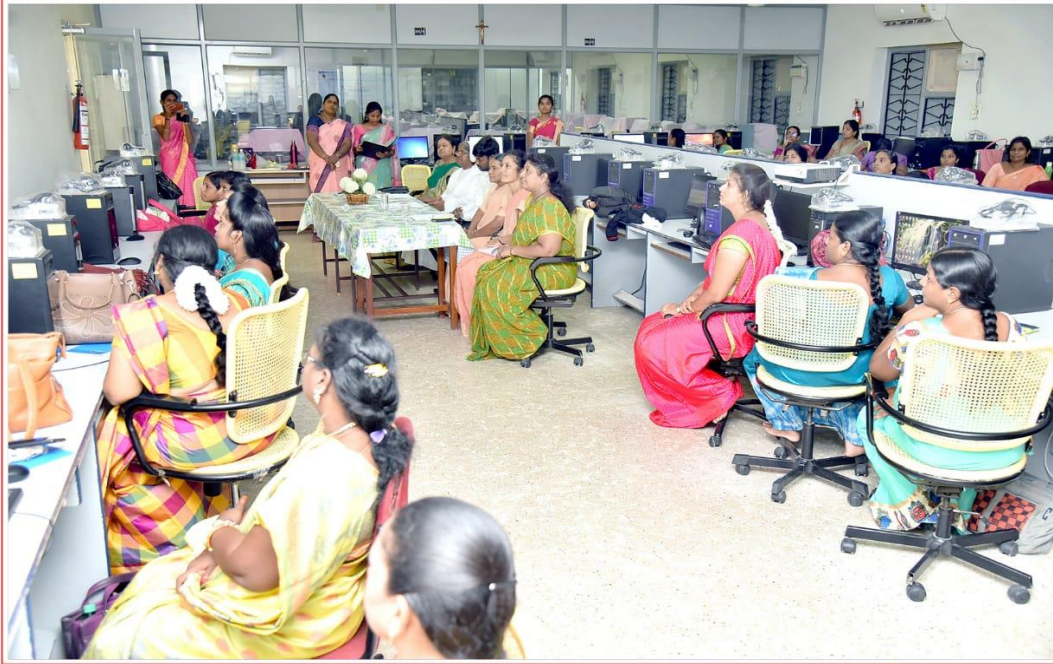
47 faculty members benefitted through the National Level FDP (26.09.2019)