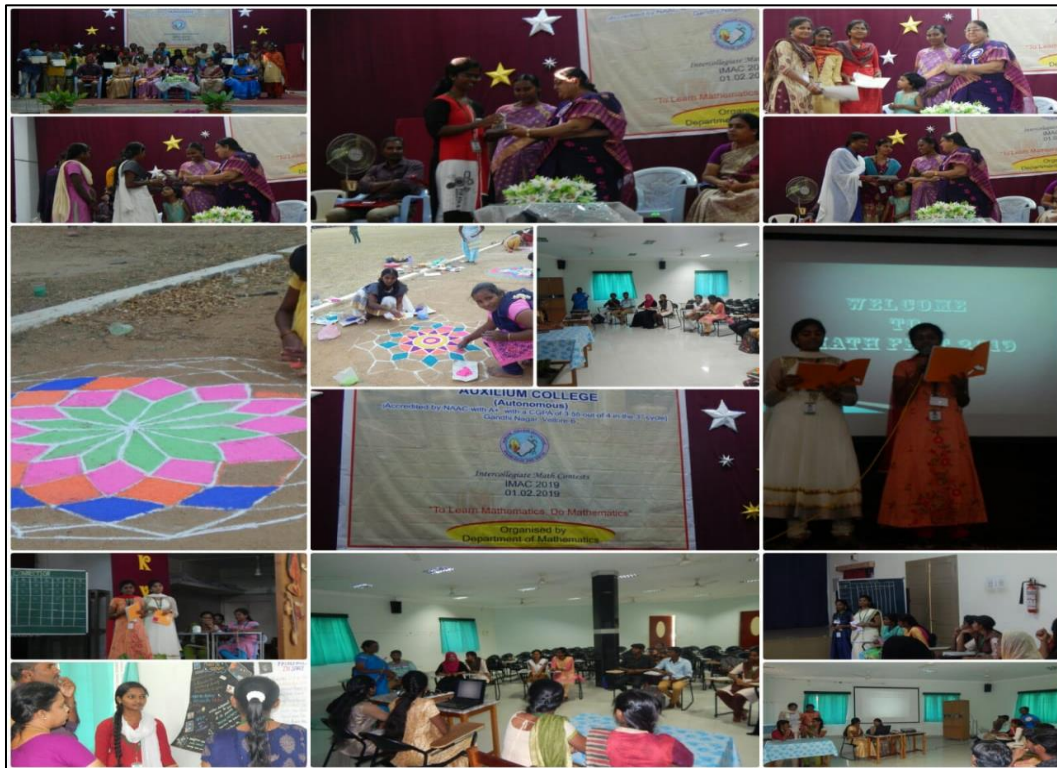
Around 185 B.Sc. Mathematics students from various colleges in and around Vellore participated in the Intercollegiate Math Contest (01.02.2019)