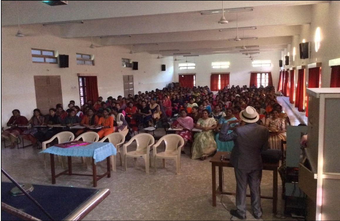
120 students benefitted through a Special Lecture (29.01.2020)