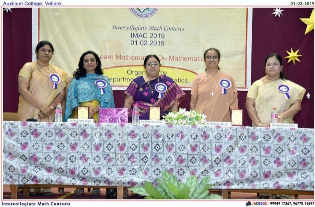
“Intercollegiate Math Contest (IMAC – 2019)” organized by the Department of Mathematics (Sec B) on 01.02.2019